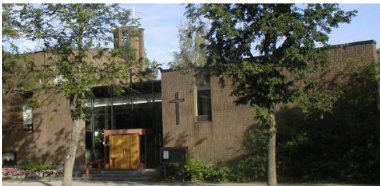
(Pieksämäki new church)