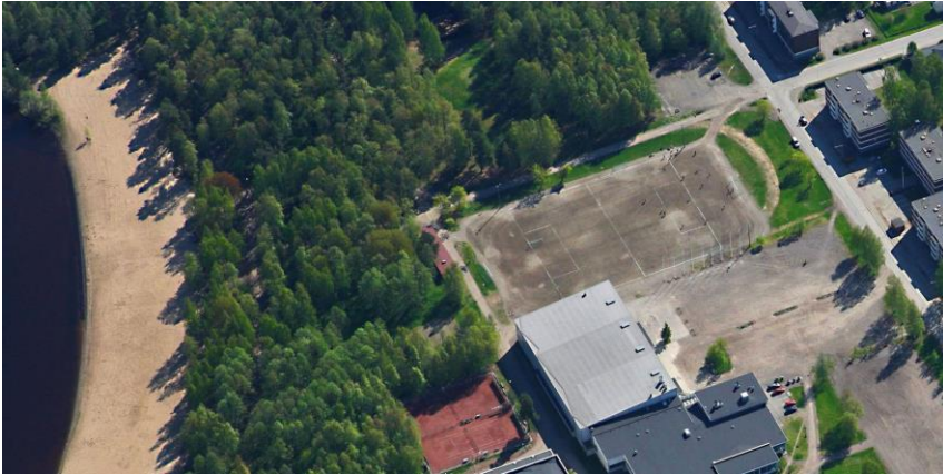
(Hiekanpää Sportpark)