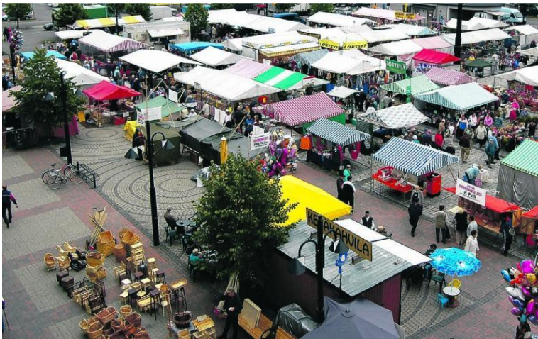
Market place, Pieksämäki